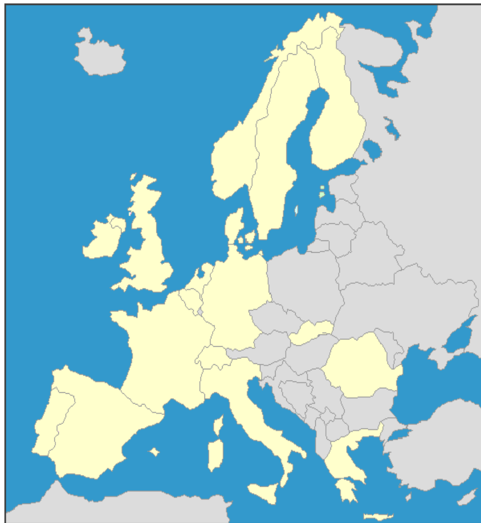
Figure: Representation in ENCePP